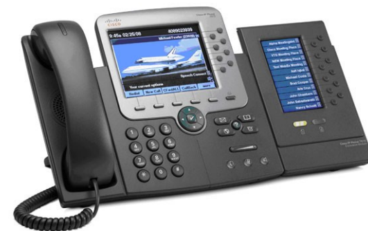
Model shown: 7975 with 7916 expansion module